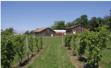
A view from Spring

When these cherries bloom next spring, the grapes will bud out again for the coming season. I will then see the flowers falling over the greens on the grapes that grow larger everyday. That's the promise that has been, and will be here for a long time and that's what I believe in.